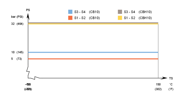
CB10/CBH10 - UL approval pressure/temperature graph

CB10/CBH10 - PED approval pressure/temperature graph