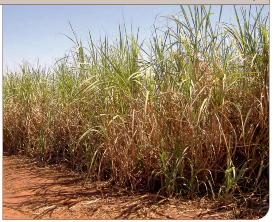
Sugar cane crops, the basic raw material for Brazil's sugar and ethanol industry.

heat the sugar production process, and the excess live steam is used to drive a turbine that produces electricity which is sold to the national grid.