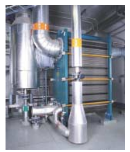
One of seven plate evaporators installed at The Absolut Company.

Vapour from the top of the columns is condensed in plate evaporators on the welded side of the semi-welded cassette. Low-temperature steam is produced on the gasketed side of the cassette by using hot sub-atmospheric water at the saturation temperature as a cooling medium. The plate evaporator's large portholes and small condensate ports makes it perfectly suited for efficient handling of high-volume twophase flows in both channels. The Åhus installation makes maximum use of this feature.